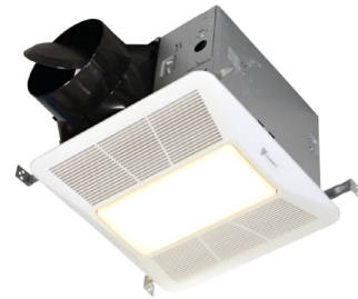
Shown with optional LED light kit