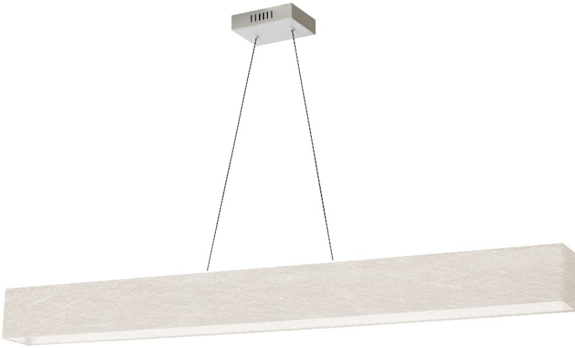
30W Horizontal Polished Chrome Pendant with Cream/Clear Shade