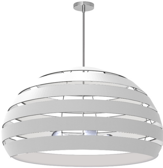
4 Light Polished Chrome Chandelier w/ White Shade

Height 23 Width/Length 36 Depth 36 Weight 25