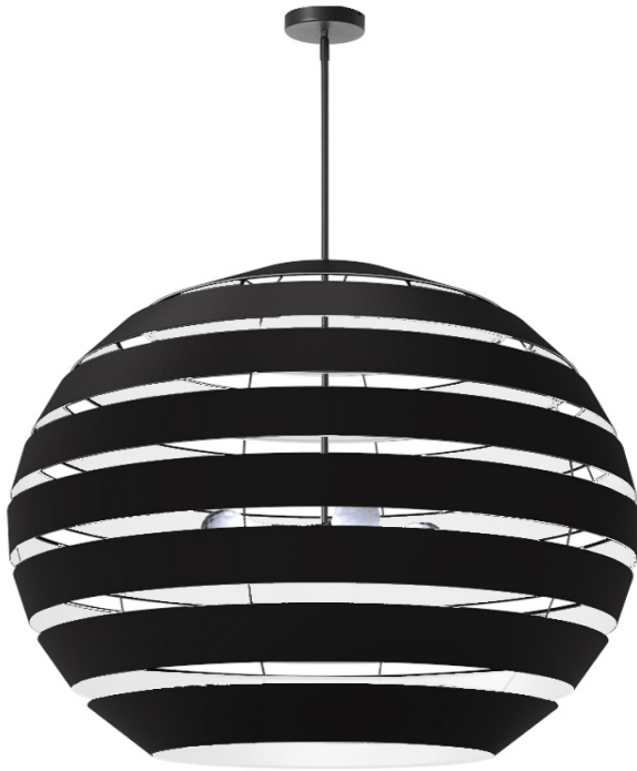
4 Light Matte Black Chandelier with Black Shade