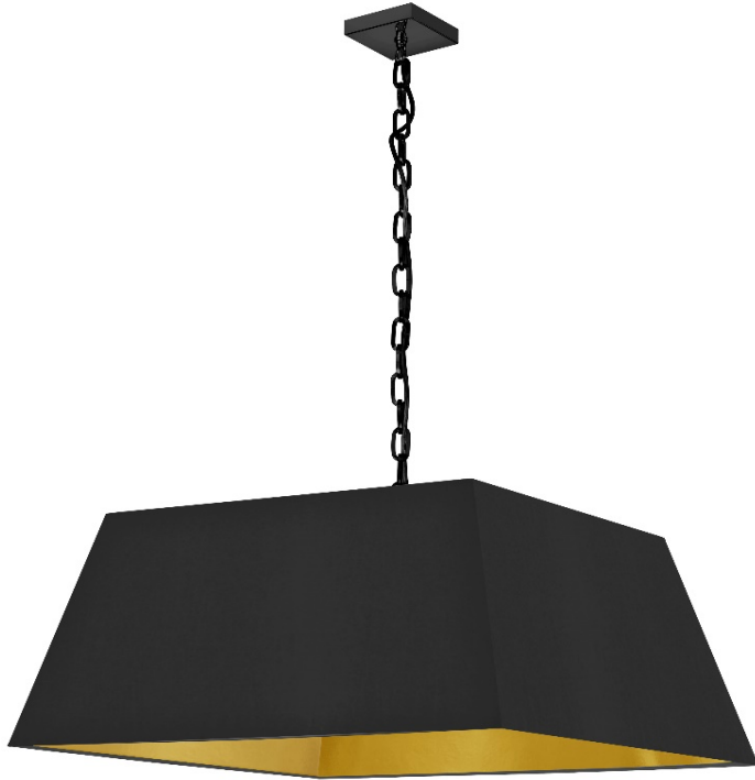
1 Light Large Black Milano Pendant Black/Gold Shade