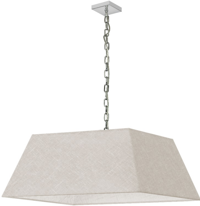
1 Light Large Polished Chrome Milano Pendant Cream/Clear Shade