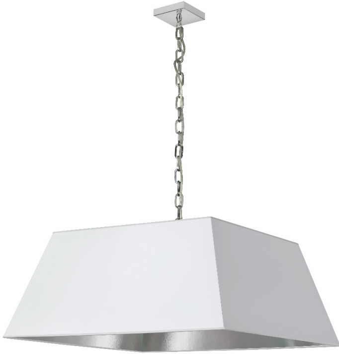
1 Light Large Polished Chrome Milano Pendant White/Silver Shade