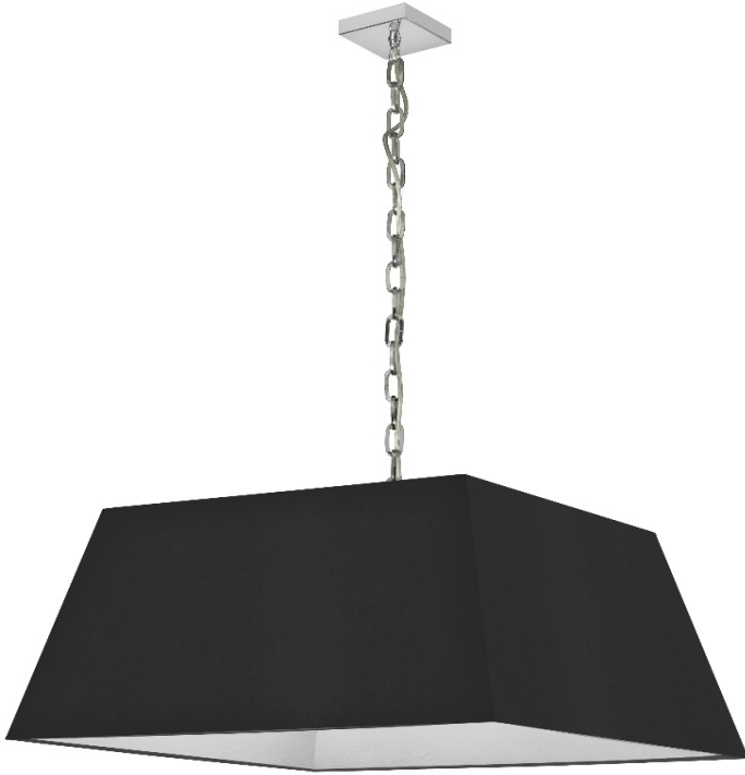
1 Light Large Polished Chrome Milano Pendant Black Shade