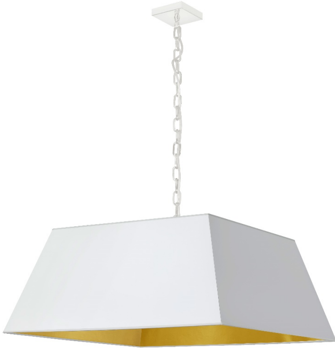
1 Light Large White Milano Pendant White/Gold Shade