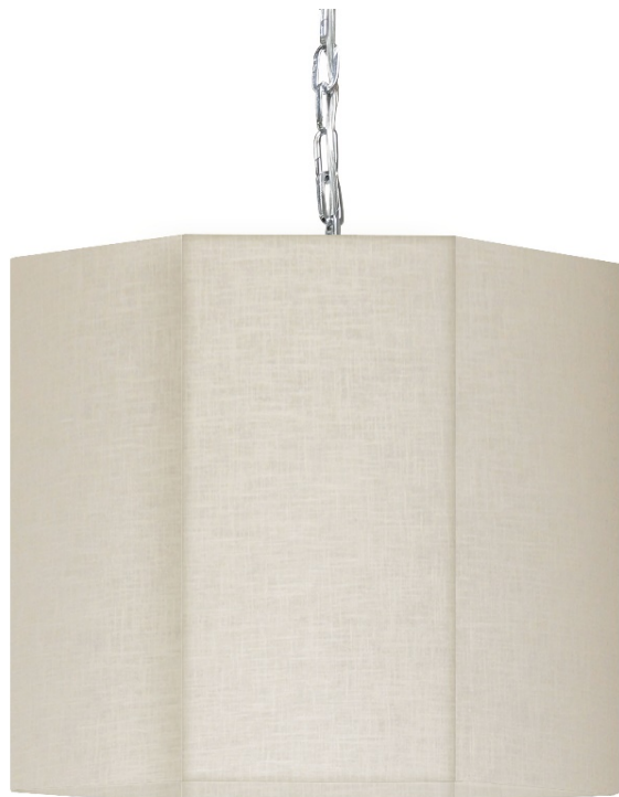
1 Light Incandescent Polished Chrome Pendant w/ Cream/Clear Shade