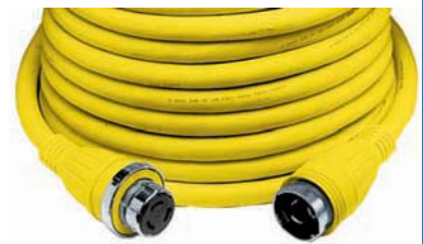
HBL61CM53 HBL61CM53W HBL61CM43

Notes: + Boots are not UL listed. • Features and benefits on page 14.