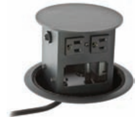
WSBH42U with WSBHTRBK