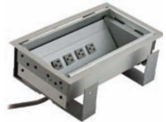
WSBG43USV (cover doors shown open)