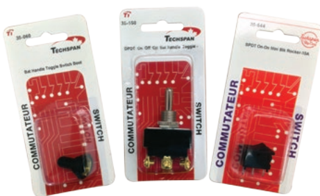
Retail Card Packaging