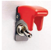
With cover up.

Provides the maximum protection, and can be easily added to an already installed switch by unscrewing and replacing the facenut. Spring-loaded snap action cover returns the switch to the 'safe' position when closed, and secures it there. Rugged red melamine cover is colorfast at temperature extremes and is resistant to most contaminants, like fuel oil. Recommended for use with standard 11/16" toggle handle Off-On or On-On switches with a keyway in the bushing. Steel faceplate with black glossy finish. Height closed 1.08"; height open 1.71". 1.80" long x .67" wide. Mounting hole diameter .47". Accepts switches with standard 15/32" diameter mounting stems.